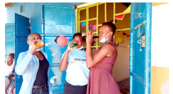
WE DRINK TO THE OPENING

Even without have a lot of fancy thing you need to do an official opening, we decorated it, got a few soft drinks to mark the occasion and in the place of the cake we went to make ugali/maize meal or fufu just to mark the accession.