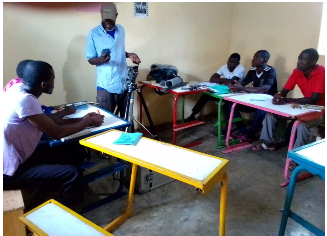
Now we have alternative furniture in our classrooms

Today, thanks to the sponsors of transport of our equipment from Nairobi to Busia, we are proud and happy to say that we have an alternative sitting arrangements for now, and although not the best, but it's much better than sitting down.