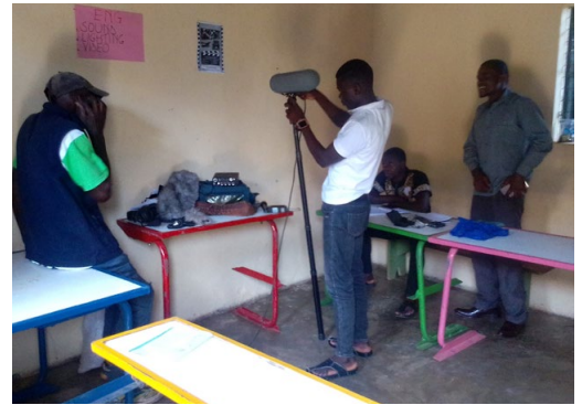
Students learning to fix the boom mike