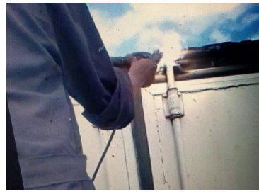
Weilding and sealing the doors of a broken into container

ALMOST ALL OUR OFFICE TOOLS, CLASS FURNITURE AND ACCESSORIES WERE STOLEN FROM OUR CONTAINER AND WE MADE IMPROVISED AND TEMPORARY FURNITURE