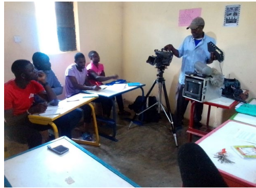
Students learning about ENG set-up in classroom

We are growing steadily and better. As for now all our classes in the classroom for theory, in the classroom for practical's and in the field for more and hand on practical's are all going on smoothly as seen here in these pictures.