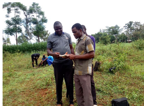
Students working on final notes in the field