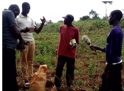
Students doing practicals in the field