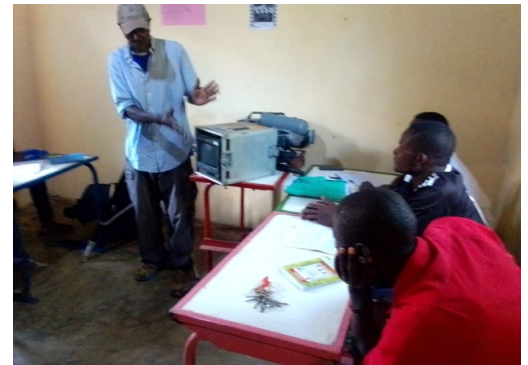
ENG - connecting the monitor