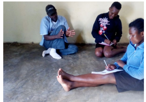
Students doing practicals in the field

Despite the fact that we had empty classrooms without furniture we went ahead and stayed our theory class while sitting on the floor.