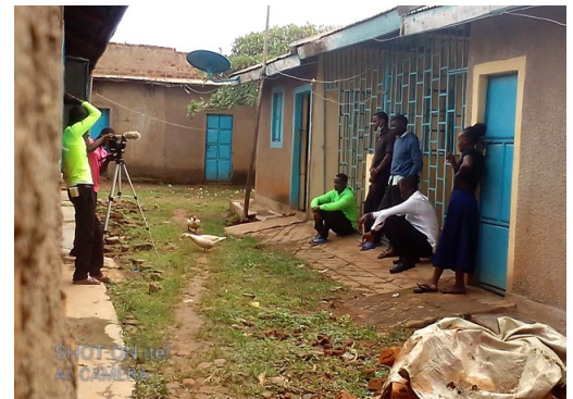
Students peactising camera with lizz out side the classroom