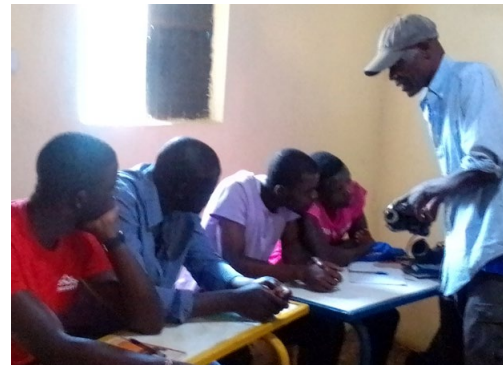
ENG - about the Telelens

FINALLY OUR SCHOOL PRACTICAL ENG PRACTICAL TRAINING STARTED WITH THE ARRIVAL OF OUR EQUIPMENT AT OUR BASE IN NABUSYONGO, IN MATAYOS, BUSIA COUNTY