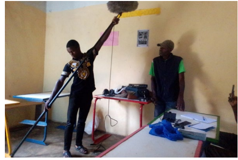
ENG practical Boom-mike