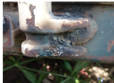
Weilded and sealing bottom container door while Containers still in Nairobi Early 2021