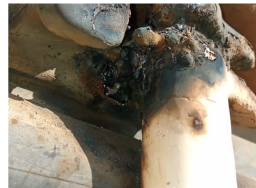
Weilded and sealing top container doors while Containers still in Nairobi Early 2021